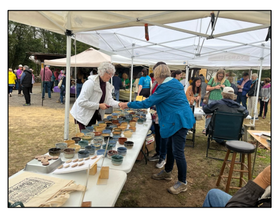
Pottery and tee shirts are sold at WoodStoke above..