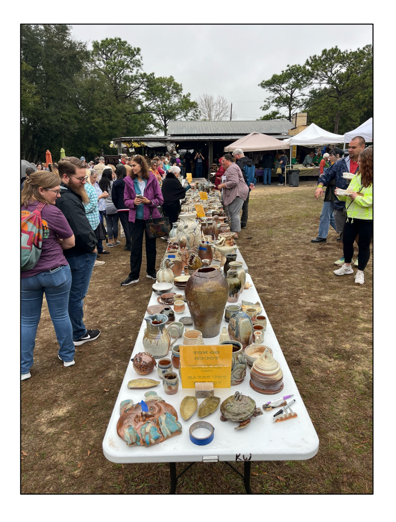
Exhibit Coming in 2025.